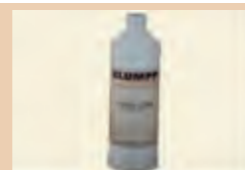
HYDRO CARE Art. 024-000-00753