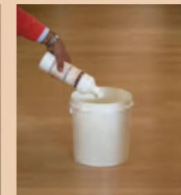
3. Care with HYDRO CARE