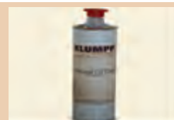
NATURAL OIL CARE Art. 075-000-00010