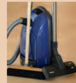
1. Dry cleaning with vacuum cleaner or soft brush

Do not use any microfiber mops, it may scratch your wood floors.