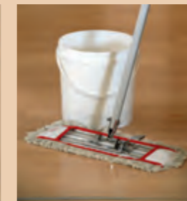
2. Routine cleaning with HYDRO CLEANER or vinegar-water