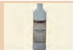
HYDRO CLEANER Art. 024-000-00755