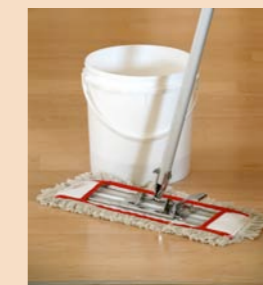
2. Wet cleaning with HYDRO CLEANER or Vinegar-water