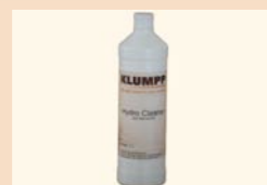
HYDRO CLEANER Art. 024-000-00755