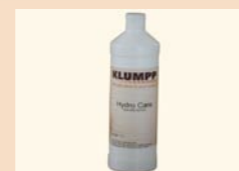
HYDRO CARE Art. 024-000-00753