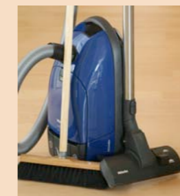
1. Dry cleaning with vacuum cleaner or soft brush

Don't use any type of microfiber mop as it may scratch your flooring.