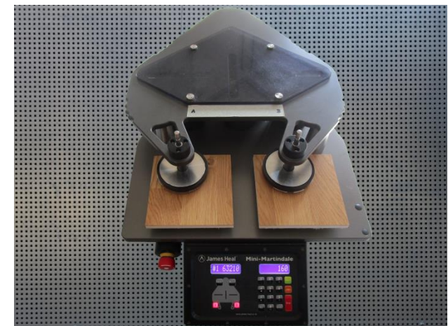
Martindale abrasion and pilling tester

Interested? Click here for more information